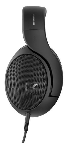
The HD 560S uses an ultralight chassis to provide a "barely there" experience on the head and ears

Extensive listening sessions require headphones that are extremely comfortable, or better yet, feel like they are not even there. The HD 560S uses an ultralight chassis for distraction-free listening. The open, around-the-ear design offers benefits beyond natural sound — the ventilated cup remains cool without touching the wearer's ears. Even the velour earpads have been carefully considered to keep all contact points soft to the touch for comfortable long-term listening.